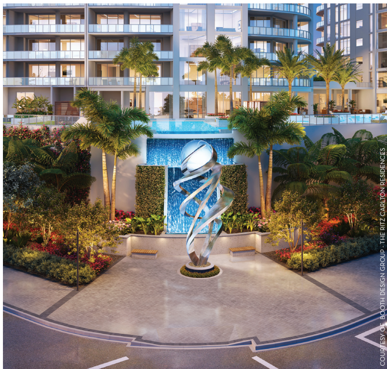
THE RITZ-CARLTON RESIDENCES