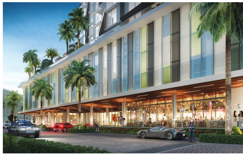
AURA, A NEW NAPLES HIGH-RISE, WILL BE PART OF A MIXED-USE COMMUNITY WHERE RESIDENTS WILL HAVE ACCESS TO MULTIPLE AMENITIES AT A CENTRAL LOCATION.